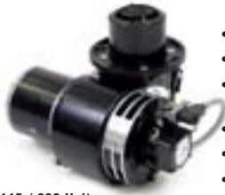
115 / 230 Volt