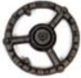
Gas Burner Ring

The Standard for Gas-Fired Pressure Washers. Impinged Jet Burner Rings offer the most efficient utilization of gas for heating water.